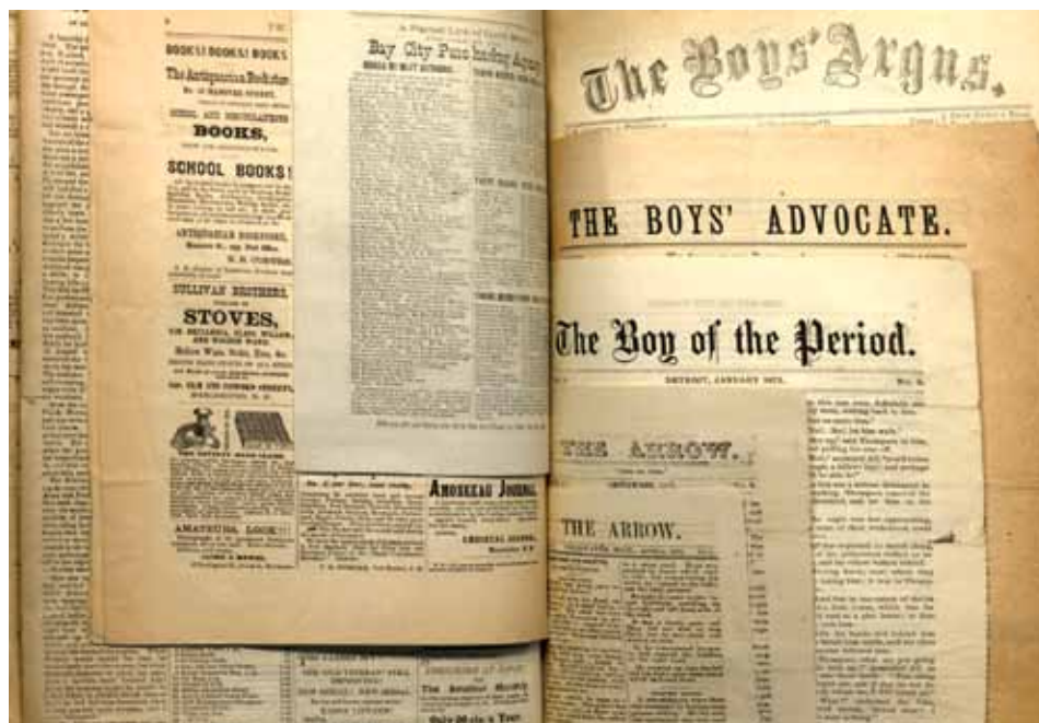
Issues from 1873 in the Edwin Hadley Smith Collection, vol. 11, Library of Amateur Journalism, Department of Special Collections, Memorial Library.

Despite its size, or perhaps because of it, the collection has had numerous institutional homes and owners: in 1908, at the Pratt Institute in Brooklyn; a few years later, at the Columbia School of Journalism; then acquired by the Fossils, an organization devoted to the history of amateur journalism. The collection, sometimes called the Fossil Library, continued to grow through gifts of papers from individual members; an offer by the Library of Congress was considered and ultimately rejected; and by the mid-