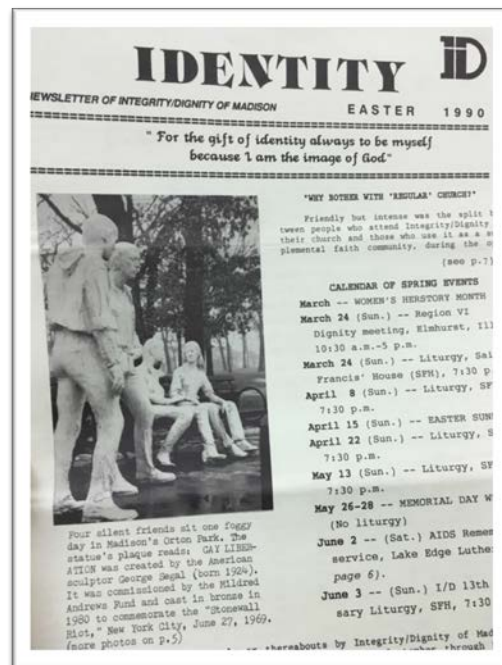
Newsletter from the Integrity/Dignity collection featuring the Gay Liberation Monument by George Segal.