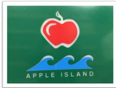
Sign from Apple Island, a women's performance space, from the Pat Calchina collection